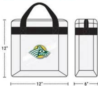
CLEAR BAGS No larger than 12" x 6" x 12"