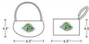
SMALL CLUTCH BAGS AND PURSES No larger than 4.5" x 6.5"